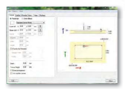
ClickMILL™ is a simple milling solution for surfacing, drilling holes and pocketing without using 3D CAD (Computer Aided Design) software.

which would challenge standard omplex shapes, can be produced with ualize designs quickly and easily.