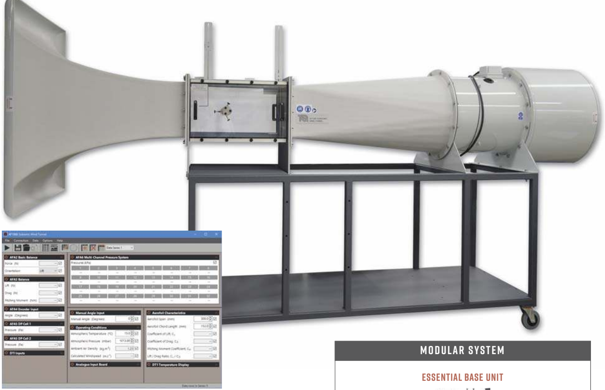
SCREENSHOT OF THE OPTIONAL VDAS® SOFTWARE

A compact, free-standing open-circuit suction subsonic wind tunnel with a working section of 300 mm by 300 mm and 600 mm long, allowing students to perform advanced study such as analysing boundary layers, performing flow visualisation and observing velocity in the wake, offering extensive teaching and research functionality.