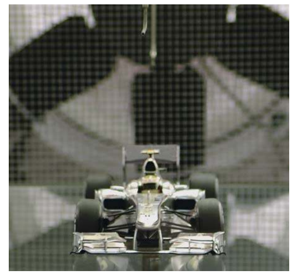
MODEL CAR IN THE SUBSONIC WIND TUNNEL