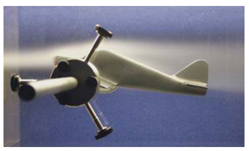
SMOKE TRAIL AROUND THE LOW WING AIRCRAFT MODEL

NOTE: The AF1300 is supplied with a standard Pitot tube, a Pitot static tube and a manometer (built into the control panel). Some or all of these instruments will be required, in addition to the optional instruments listed here, to complete the experiments.