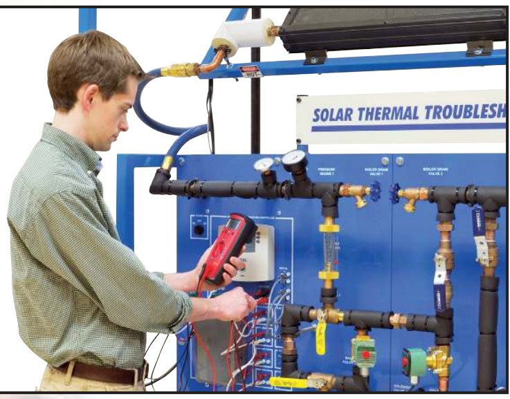
Student Reacting to Electrical Fault

At the heart of a technician's skill set is the ability to troubleshoot a system. The 950-STOL1 is equipped with a wide array of both electrical and fluid faults that allow instructors to replicate realistic system and component failures students. Students will learn to independently solve the many common types of situations they will encounter on the job.